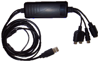
Ordering Code: 9811/9812

The USB Frame Grabber connects a video camera to any laptop or desktop computer with a USB port. It provides the same level of performance as an internal frame grabber with a 30 frames/second capture rate at full NTSC 640 x 480 pixel resolution. The USB Frame Grabber supports the popular Microsoft DirectShow® WDM format which makes it compatible with hundreds of commercial programs written for that standard.