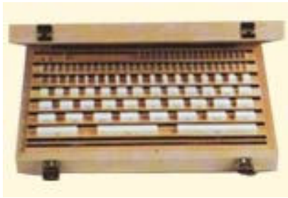
Model : PT-5201

CERAMIC GAUGE BLOCKS have the following advantage high strength, high-temperature resistance, wear-resistance, anti-magnetic, anti-rust and anti-corrosion.