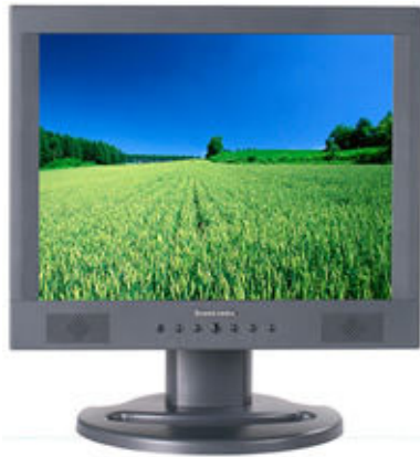
20.1" LCD CCTV Monitor